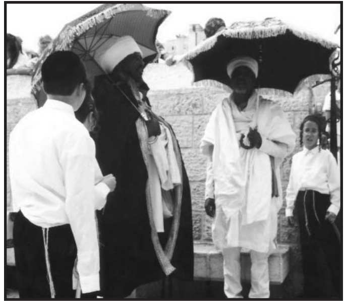
Ethiopian and non-ethiopian Jews in Israel

Would I understand everything happening around me? No, I wouldn't. Israel has an annoying habit of conducting its life in Hebrew, a language I never really learned. I'd feel a bit like an outsider. And I'd be reminded that in abandoning a serious commitment to Hebrew, American Judaism made an error of historic dimensions. If I worked at it, I might eventually understand Israel's movies, papers and radio, and feel its soul even more intimately.