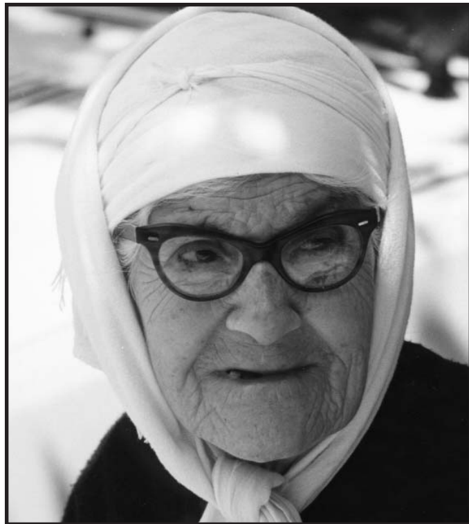
Old woman of Israel

In the tradition of Jonathan Swift, I herewith offer a "modest proposal" that would permit many more Diaspora Jews to be part of our angst and our joy, the tears and the celebrations of Israeli life. They'd understand us better than they can from either their perches in suburban America or the luxury hotels in which